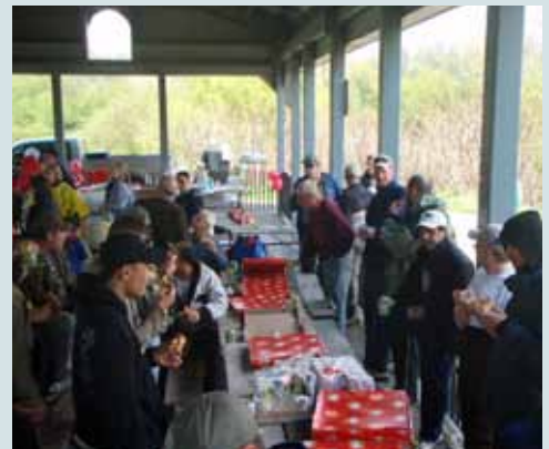
The 2011 Steelhead Tournament participants enjoying lunch after a fun morning on the water