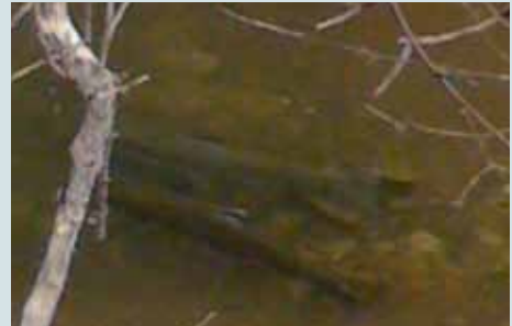
A pair of CRAA tagged Steelhead on a redd

runs and late spring. Fresh run steelhead were in the Credit for almost 10 full months, from late August until early June. Talk about a world-class fishery!