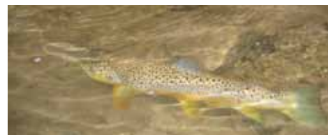
Browns are often difficult to spot against the gravel bottom