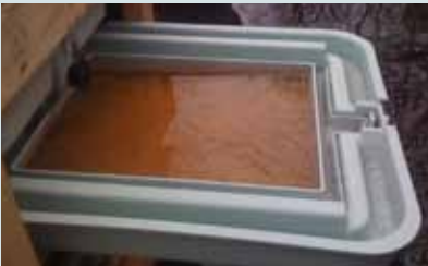
New hatchery heath trays look to keep better care of CRAA eggs and fry

This past spring saw CRAA collect our 50,000 green eggs from wild Credit River steelhead at the Streetsville dam. Thanks to the amazing heath tray system we installed, the hatch was 95% and with excellent survival to date we have at least 46,000 steelhead fry