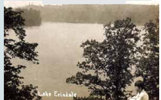
Lake Erindale was created by the Erindale Dam seen in the photo below...