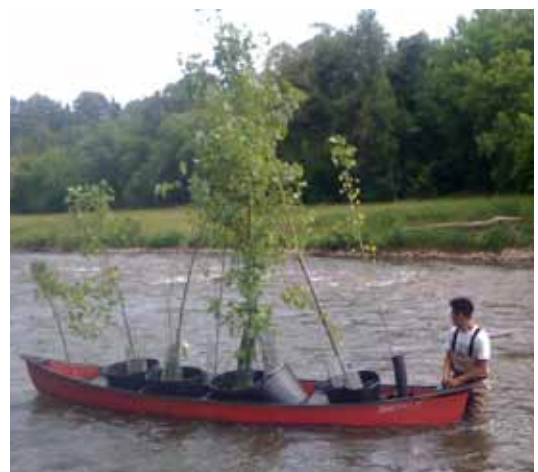
The summer crew planting at the falling rocks using the canoe to transfer the trees across the river. Zero Emissions!

CRAA again received funding to hire a summer crew of 3 students. They were hired in late May and have been working hard to plant trees, maintain the nursery and continue maintenance on past planting sites. The crew will work through to late August. If you see them in the field be sure to say hello and if you would like to help just drop us a line.