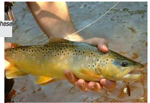
Another spinner took this gorgeous brown

Proper handling technique (displayed in many of these shots) is key to their survival after being released