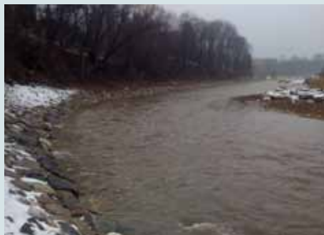
CRAA was involved in the public design phase of this huge bank stabilization project built by Mississauga over the winter of 2011 downstream of Britannia Road

with adding six new lanes to the bridge crossing over the Credit River. This is a long term project with rehabilitation work starting this year and widening of the bridge and QEW in 2015. The present plan is to stay out of the river, but new piers to support the bridge will be needed within the valley.