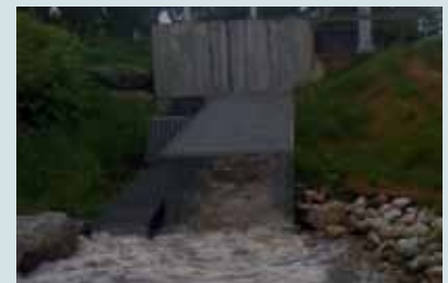
MNR staff in conjunction with CRAA president John Kendell tested the Norval fishway and found 12 different species of fish using the passageway

was not the trout, but the minnows. The trap had well over 500 minnows including flathead minnows, shiners and chub. The surprise were the three largemouth bass around a pound each! If species that do not jump are using the ladder we are confident it will be easy passage for larger trout and salmon!