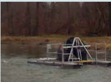
The Smolt Wheel installed on the Credit in the spring to study natural reproduction numbers

MNR, CVC and Atlantic Salmon Restoration Program partner on juvenile salmonid assesment