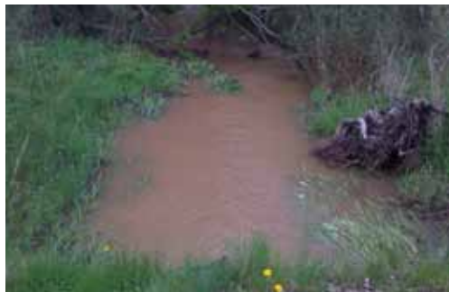
Sediment ridden run-off from a Brampton housing development site was the source of two major water quality concerns on the Credit

A picture of the run-off that flowed directly into the Credit River in the Brampton region can be seen below.