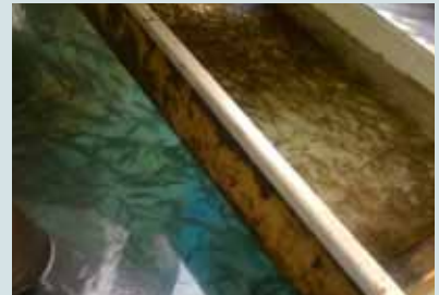
Steelhead fry in the raceway, 4-5" Coho in the tank below

steelhead we held over from spring are packing on the weight. This summer CRAA volunteers and our summer crew will be installing the last two tanks we purchased last year to add space for growing fish.