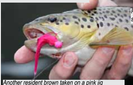
Another resident brown taken on a pink jig

Proper handling technique (displayed in many of these shots) is key to their survival after being released