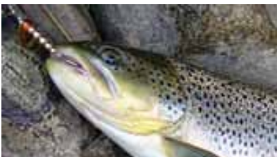
Upper Credit Brown Trout fooled by a Meeps spinner

Best access to the reach is the Inglewood area, by taking Highway 10 to Forks of the Credit Road and accessing one of the reaches in that area from a bridge crossing the river. Some areas are posted and some are open to fishing. So find an open section and enjoy! Remember to keep fish in the water, follow the regulations and have a fantastic time. It's also a great spot to bring kids to experience some beautiful scenery, trails and fishing in summer, close to home.