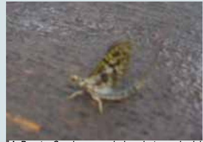
A Bronte Creek green drake photographed in Lowville Park.