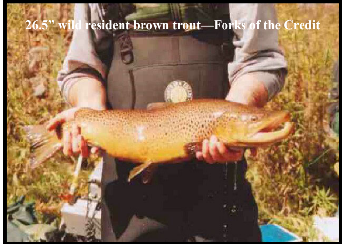
26.5" wild resident brown trout—Forks of the Credit

CRAA also operated the Streetsville Fishway this fall to lift brown trout. Apart from some bothersome