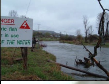
Beaver River Electro Barrier is an option!

tion for the barrier location and the type.