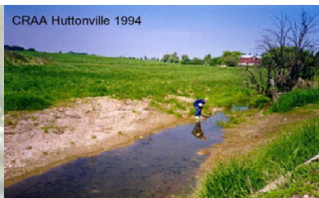
CRAA Huttonville 1994

The changes are becoming clear, and not just in the landscape!