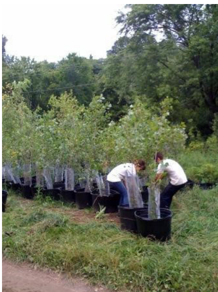
Large potted trees ready to be put next to a stream

Many anglers wonder what makes a tree important for wild