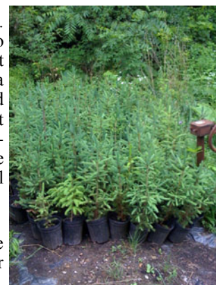
Healthy young evergreens at the CRAA Nursery

If that is not enough evidence, simply look at some of your favorite trout streams. Are they well forested? Then take a look at some streams without forest cover, such as streams in wide open pasture and farmland. These streams often lack any deep pools, fish or even life. Plant trees and come back in ten years – you will see the difference.