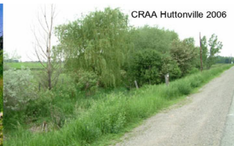
CRAA Huttonville 2006

Here are just a few "before and after" images CRAA is developing to show off our awesome work.