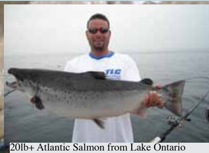
20lb+ Atlantic Salmon from Lake Ontario