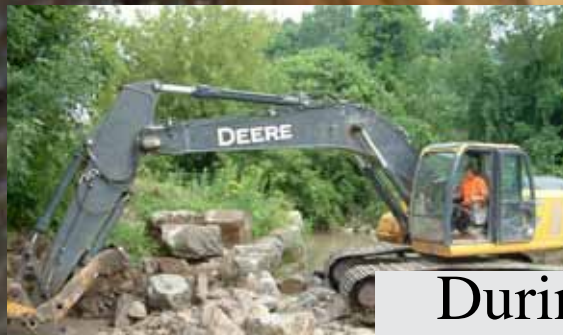
Streetsville fishway channel during... The large excavator shown above took only a few hours to complete the job.