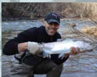
Early September Credit Steelhead

The steelhead population estimate is done yearly through a mark-recapture study. CRAA tagged 1402 steelhead between fall '09 and spring '10. The fishway was closed for manual lifts for the entire period, thus all wild steelhead were tagged. From April 1 trained CRAA members collect and record data on all spawned out steelhead caught and the location of the capture. The sample size this year was completed with a sample size of 280 fish caught, the highest sample size since 1998 as well. By looking at how many wild-tagged fish, how many wild-untagged fish and how many hatchery fish and in which reaches of the river we can calculate a fairly accurate population estimate. In 2007 the population was estimated at only 3,000 fish. With almost double the return over a