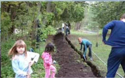
CRAA volunteers and their families helping with the trench

upgrades is a full electrical UV system that was in operation as of May 15, 2010. The UV filter kills bacteria that occurs in the groundwater, this greatly improves fish survival in the hatchery. The bacterial problem was highlighted last year when the Atlantic salmon we raised had several die offs from the naturally occurring pest. The Brown Trout and Steelhead were also affected by a similar level of mortality, especially in the fry stages. Great work by all the volunteers, I am sure the fish will notice a huge difference!