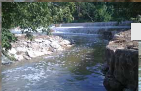
Streetsville fishway channel after... CLEAR PATH for all fish to locate and use the ladder!