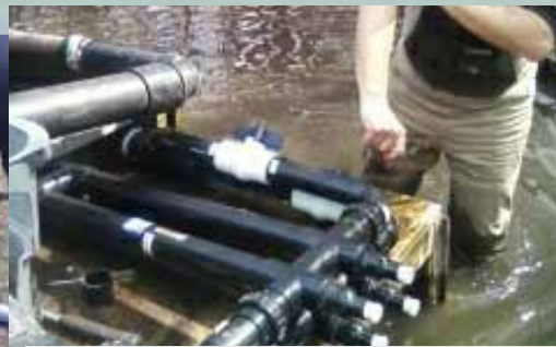
Some of the vital plumbing that makes the hatchery work!