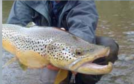
7lb Resident brown trout caught in lower Credit.

fish interaction than competition. Diversity, through maximum habitat accessibility is often the greatest source for not only developing a huge wild population, but buffering the population from harvest and weather impacts. Anyone hear of the term "biodiversity"?