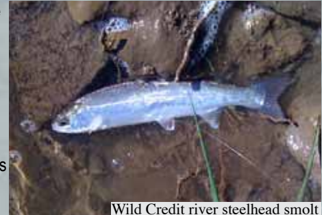
Wild Credit river steelhead smolt

This massive increase in biomass has no other explanation than CRAA's adult transfers. Otherwise all these survey sites would be void of steelhead! There is no doubt the hard work has already started to pay off with wild fish returns exceeding 73% in 2010 and our best lift in 12 years at Streetsville.