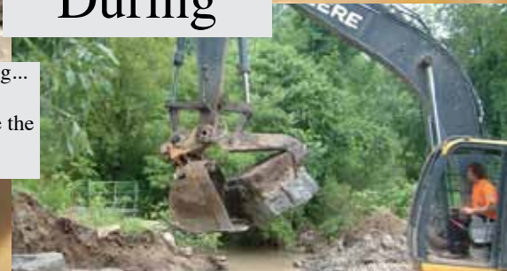
Streetsville fishway channel during... The work crew re-arranged the armour stone along the fishway channel to decrease the possibility of the channel silting in during spring floods.