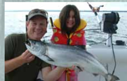
Stocked (adipose fin clipped) chinook Salmon from Lake Ontario

the main adult population in summer 2011. Ontario is not managing for wild salmon, but it looks like we should be! The early data suggests that stocked Chinooks are very important, but so are wild Chinooks and balancing wild and hatchery fish levels to meet baitfish levels will be vital to ensure we avoid a similar fishery crash to the one that was seen on Lakes Michigan, Huron and in Georgian Bay in recent years.