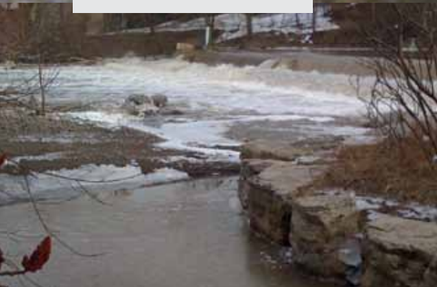
Streetsville fishway channel before... clogged with silt and debris. Few fish found the ladder.